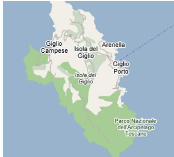
A map of the Island

Giglio Island is an Italian island and town located in Tyrrhenian Sea, is part of the Province of Grosseto and of the region of Tuscany; it is one of the seven islands that form the Tuscan archipelago.