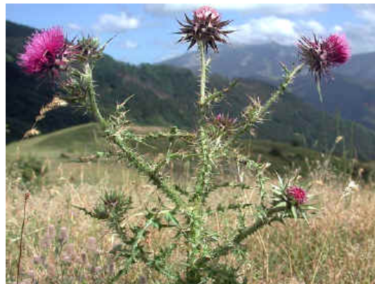
A plant of Thistle.

The flowers of the island grow up in each month of the year but the best period of growth is in May because it is the period of rain and they flourish faster than in other periods.