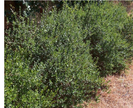
A plant of Myrtle

The vegetation of the island grows up especially along the western coast of Giglio Campese, on the east side of Poggio del Castello and in Moulino Valley.